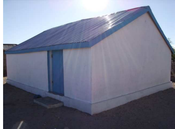
Repaired food storeroom

As the president of Ifaty said to ReefDoctor, “we have never in all our years ever received such a gift from the westerners even with all these hotels around us who have never really helped our children. What you have done will never be forgotten and we have no way to repay you and can only hope to continue working with you towards the improvements of the school for our children, thank you on behalf of all Ifaty”