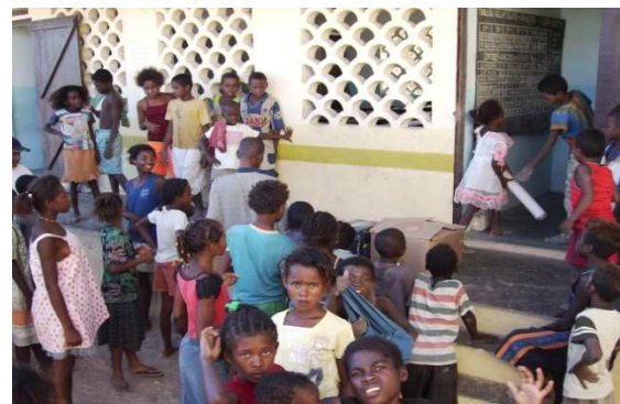
School children help unload materials

ReefDoctor bought the best quality materials available to ensure they last in the hot and humid conditions.