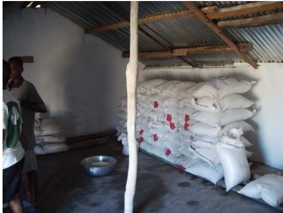
Repaired storeroom - now cement floor

The success of the repair highly impressed the community and school ministry and helped with the continued good relations between ReefDoctor, Rotary and the community, while also motivating families to keep their children in school.