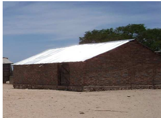
Old school food storeroom