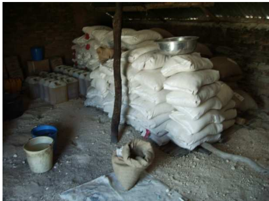
Inside old food storeroom - no covered floor

The Ifaty Primary schools food store area was in desperate need of repairs to ensure the food from the WFP (UN world food program) for the children was keep in a hygienic state as the food was being eaten by rats as the floor of the building was just dirt and infested with insects.