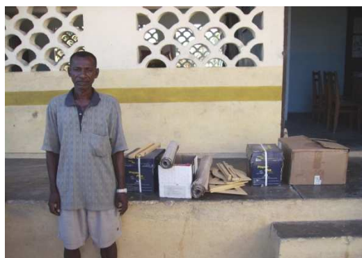
Head Master with some of the materials